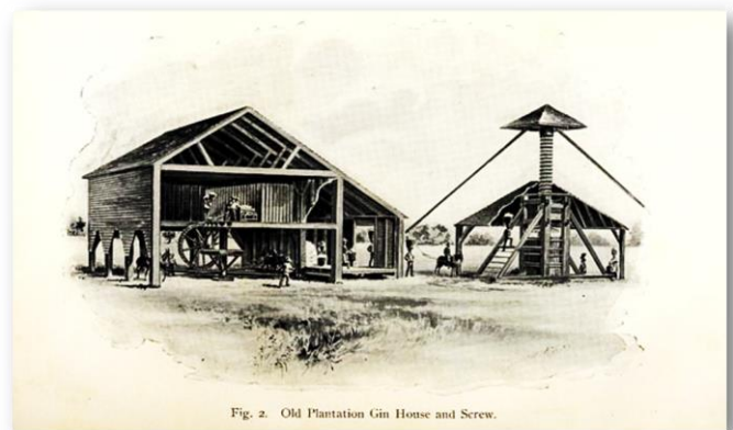
Fig. 2. Old Plantation Gin House and Screw.