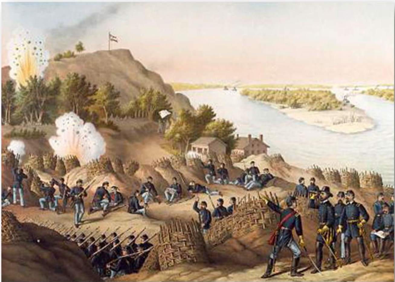
The Siege of Vicksburg