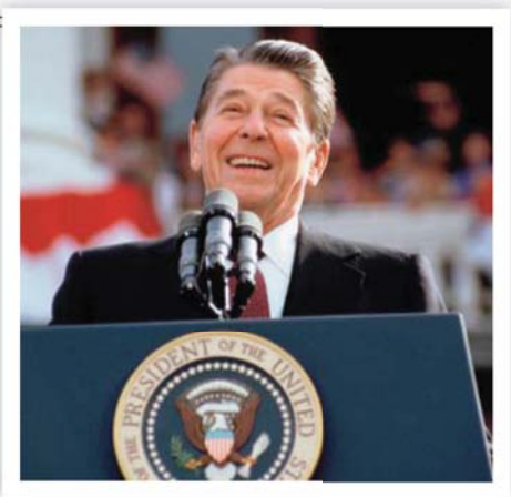
President Ronald Reagan

President Reagan would deal with these problems by consistently stressing a sweeping package of new economic policies. These economic policies, dubbed “Reaganomics,” consisted of three parts: (1) budget cuts, (2) tax cuts, and (3) increased defense spending.