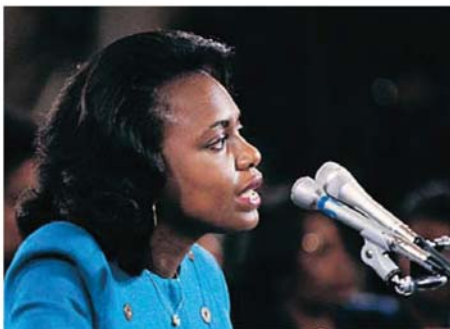
Anita Hill and Clarence Thomas testify before the Senate Judiciary Committee in October 1991.