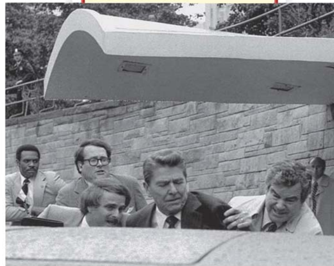
▲ President Reagan is pushed into a presidential limousine after being shot by a deranged man.

On March 30, 1981, President Reagan and other members of his staff were shot by a mentally unbalanced man named John Hinckley, Jr. While being wheeled into surgery to have a bullet removed, the president said to his wife, "Honey, I forgot to duck" (a line first used by boxer Jack Dempsey in the 1920s, after losing his heavy-weight title). In the operating room, Reagan said to the team of surgeons, "I hope you fellas are Republicans." Reagan recovered speedily and his popularity grew.