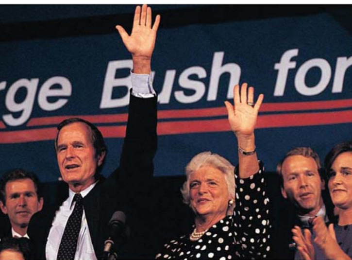
◀ George Bush announces his presidential candidacy at a rally in 1987.