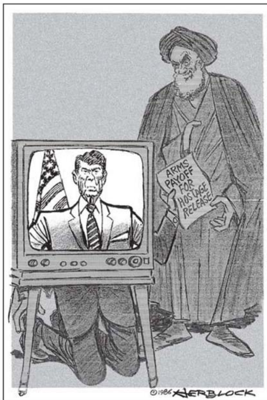
a 1986 Herbblock Cartoon, copyright by the Herb Block Foundation

Results favorable to U.S. interests were more difficult to obtain in the Middle East. Negotiating conflicts between ever-shifting governments drew the United States into scandal and its first major war since Vietnam.