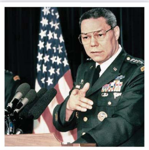
General Colin Powell

Though U.S. foreign policy in the early 1980s was marked by intense hostility toward the Soviet Union, drastic economic problems in the Soviet Union destroyed its ability to continue the Cold War standoff.