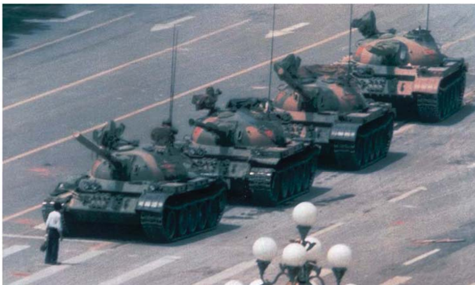
▶ A Chinese protester defies the tanks in Tiananmen Square in 1989. ▶

China's premier, Li Peng, eventually ordered the military to crush the protesters. China's armed forces stormed into Tiananmen Square, slaughtering unarmed students. The world's democratic countries watched these events in horror on television. The collapse of the pro-democracy movement left the future in China uncertain. As one student leader said, "The government has won the battle here today. But they have lost the people's hearts."