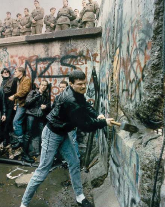
▲ A demonstrator pounds away on the Berlin Wall as East German border guards look on from above at the Brandenburg Gate, on November 11, 1989.

In October 1989, East Germans startled the world by repudiating their Communist government. On November 9, 1989, East Germany opened the Berlin Wall, allowing free passage between the two parts of the city for the first time in 28 years. East German border guards stood by and watched as Berliners pounded away with hammers and other tools at the despised wall. In early 1990, East Germany held its first free elections, and on October 3 of that year, the two German nations were united. B